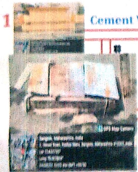
Under ground cement Water Tank