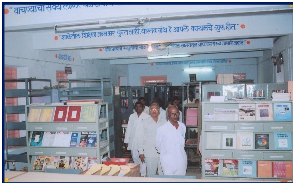
Photo: A visit of parents, Journalists with Principal to Spacious library