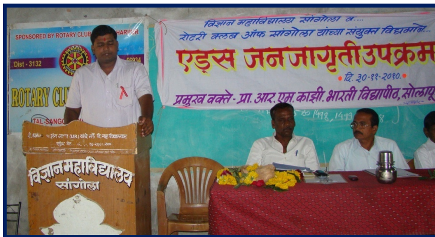
Lectures arranged in collaboration with Rotary Club of Sangola on the occasion of National HIV Day