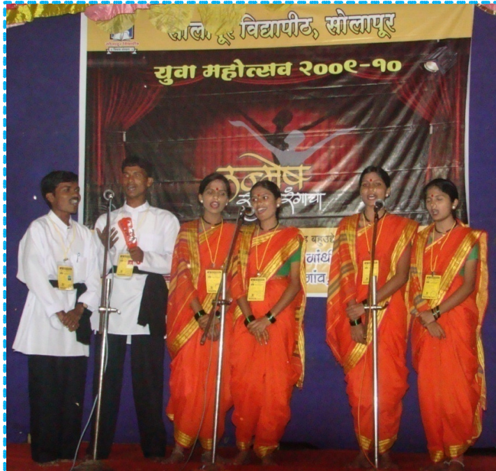
Presentation of Group song in Youth-Festival Competition at Indira Gandhi Eng. College, Kegaon, (Solapur)