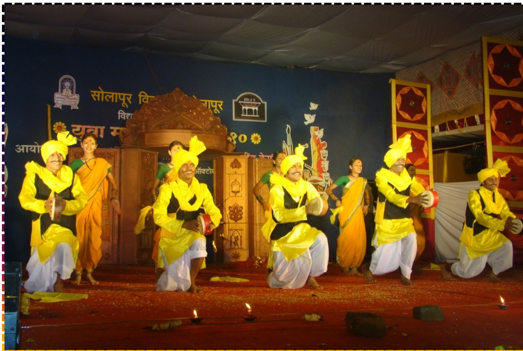
Presentation of Folk Dance in Youth-Festival Competition at Indira Gandhi Eng. College, Kegaon, (Solapur)