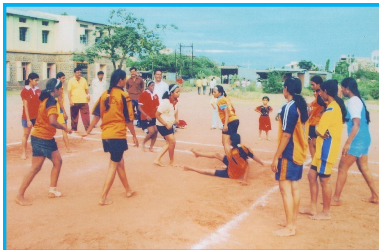
Solapur University women Kabaddi Coaching Camp

Kabaddi, Kho-Kho, Chess, Cricket, Volley Ball, Athletics, Cross Country etc.