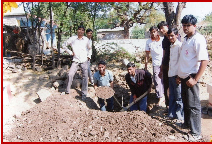
(NSS volunteers making pits for toilet in adopted village camp)