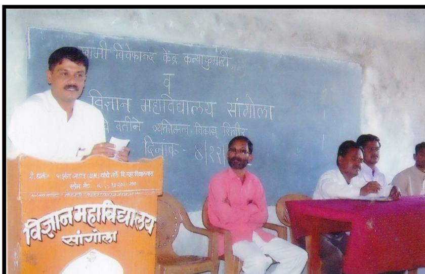
Personality development camp in association with Swami Vivekanand Centre, Kanyakumari