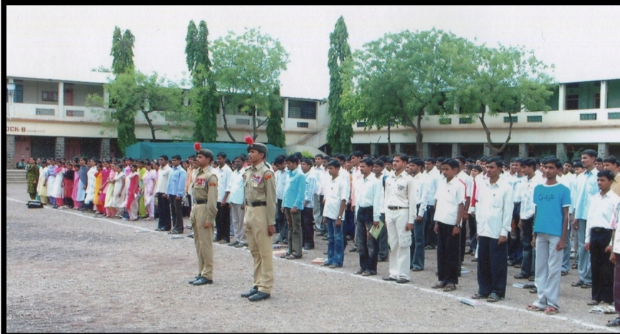
Celebration of 15 th August (Independence Day)