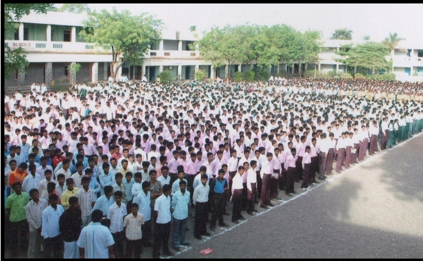
Celebration of 26 th January (Republic Day)